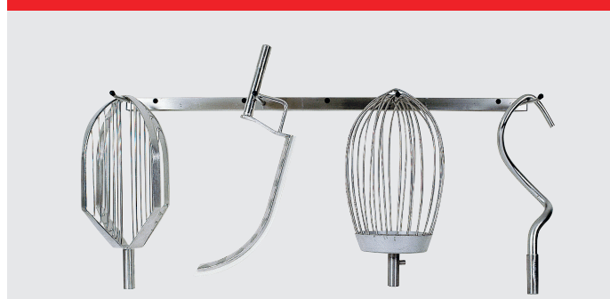
Tool rack, 91 cm