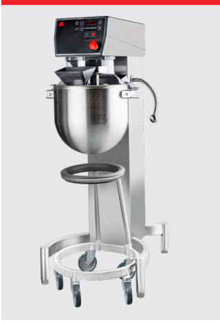
Stainless steel, 30 L