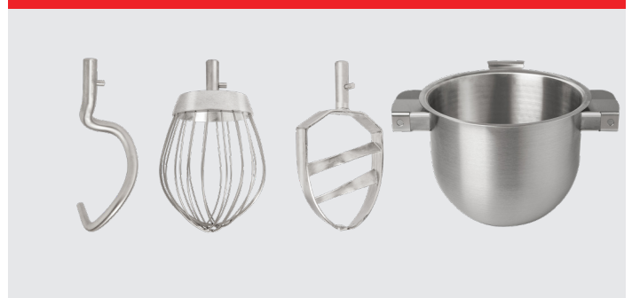
Hook, whip, beater and bowl 30/15 L in stainless steel.