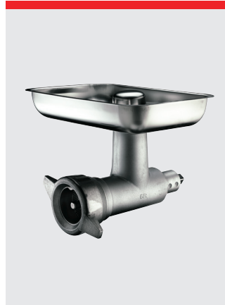
Meat mincer, 82 mm