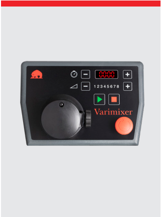
Attachment drive for meat mincer and vegetable cutter