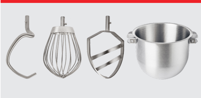
Hook, whip, beater and bowl 30 L in stainless steel.