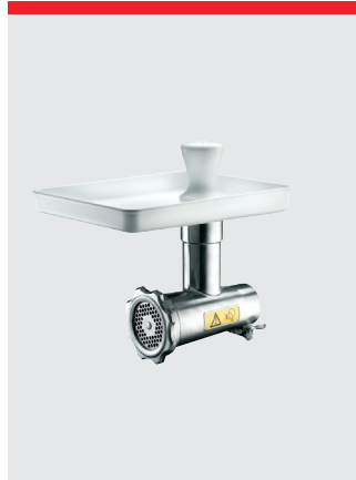
Meat mincer, 70 mm