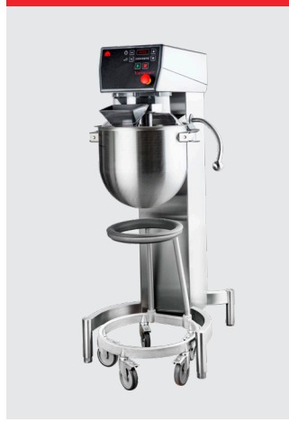
Marine version, stainless steel, 30L