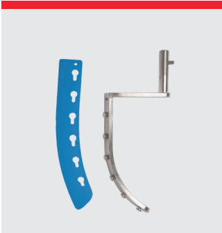
Automatic scraper in stainless steel. 30L and 30/15L.