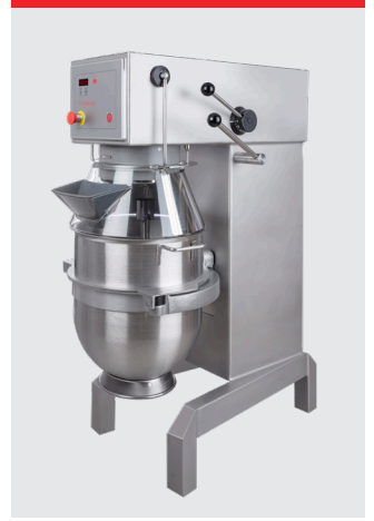
Marine version, stainless steel