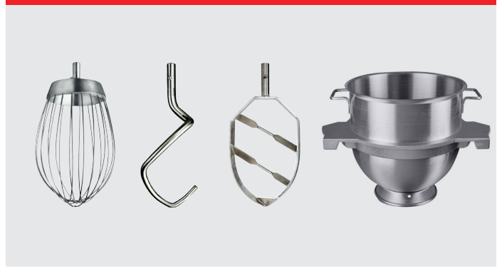
Whip, hook, beater and bowl 60/30 liter in stainless steel.