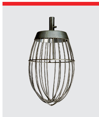
Whip with reinforcement