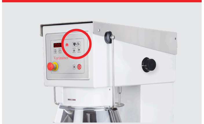
VL-1S – Automatic speed regulation and automatic bowl lowering