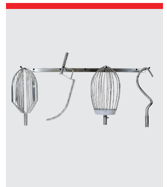
Tool rack, 127 cm