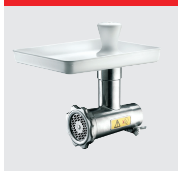
Meat mincer, 70 mm