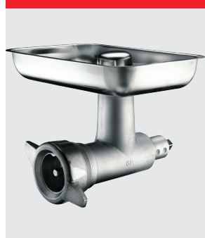
Meat mincer, 82 mm