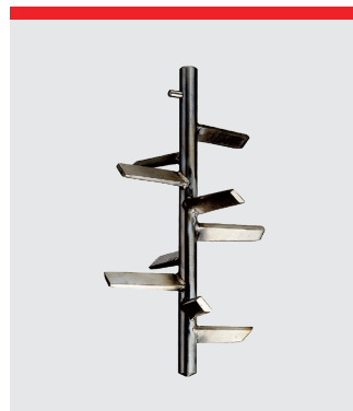
Powder mixer, stainless steel