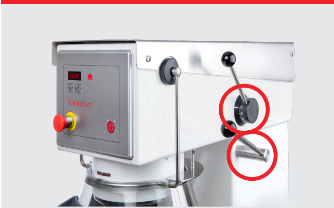
VL-1 – Manual speed regulation and manual bowl lowering