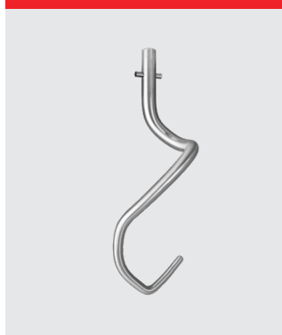
Double pinned hook for pizza