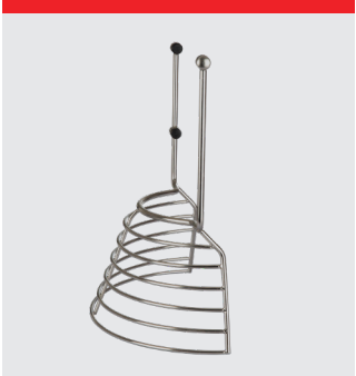
Stainless steel grid guard. Not CE-certified