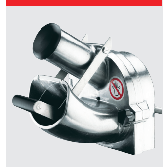
Vegetable cutter GR20