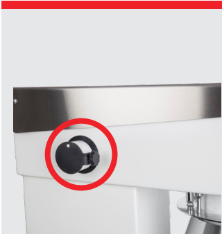
Attachment drive for meat mincer and vegetable cutter