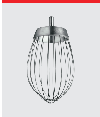
Whip with thinner wires, stainless steel