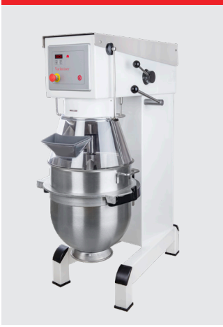
White, powder coated