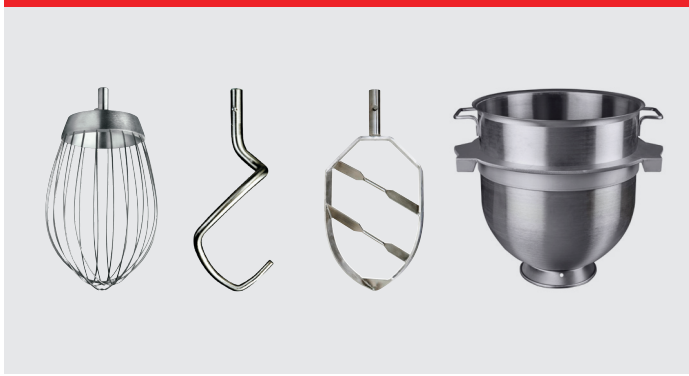
Whip, hook, beater and bowl 60 liter in stainless steel.