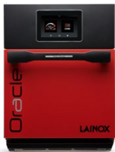
ORACRS - ORACRB