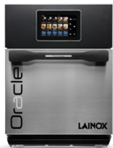
ORACGS - ORACGB