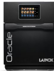
ORACBS - ORACBB