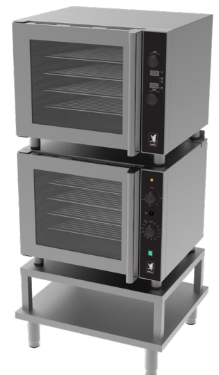
FE4D stacked on FE4M

A clearance of 150mm should be observed between appliance and any combustible wall.