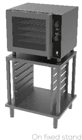
On fixed stand