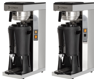
Mega Gold M