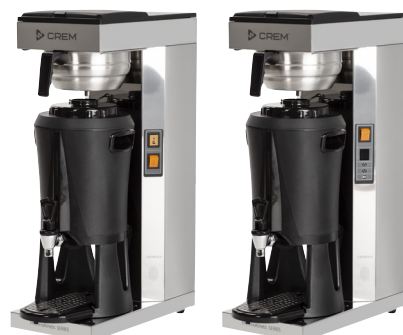
Mega Gold M TK-Series