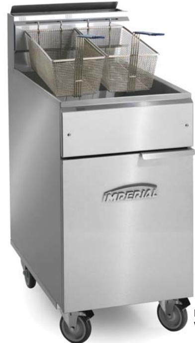
IFS-75-OP shown with optional casters

OPEN POT BURNERS - Flame heats stainless steel plates located strategically outside of the frypot.