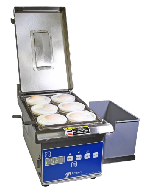
ESM-600 (pictured with Six 3-inch Egg Rack & Cover Kit - sold separately)