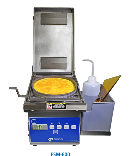
(pictured with Single 8-inch Omelet Rack & Cover Kit - sold separately)