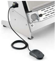
Optional pedal controls for Plus versions