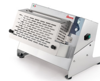
P-ROLL 420/1 Plus