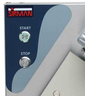
Plus versions with IP 67 stainless steel controls