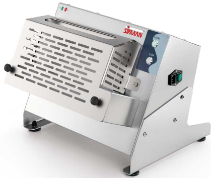
Sirman Rolling Machines , model P-roll 320/1 - 420/1 :

Authorized Distributor: FOODSERVICE EQUIPMENT MARKETING 10 CARRON PLACE-KELVIN IND.ESTATE G75 0YL GLASGOW() TEL./FAX. 0044-1355 244111 / 0044-1355 241471 E-mail:saganm@fem.co.uk