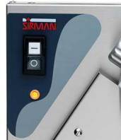
Standard versions with IP 54 controls