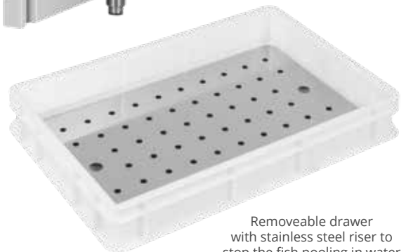
Removeable drawer with stainless steel riser to stop the fish pooling in water