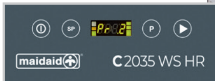
C2035 WSHR (shown with tabling – not included)