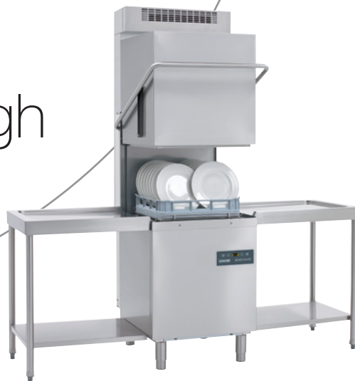
C2035 WSHR (shown with tabling – not included)