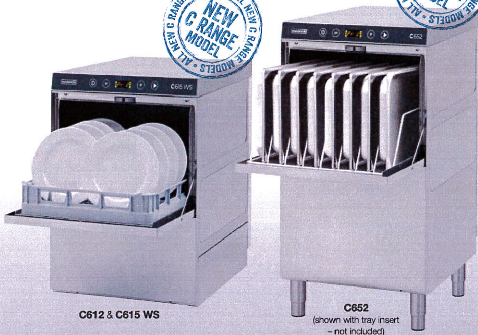
C612 &amp; C615 WS