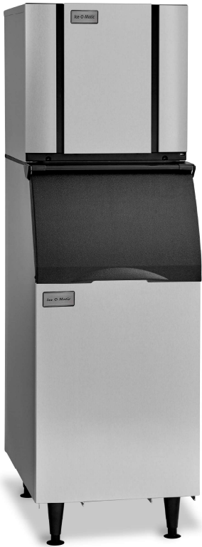
CIMO826 ON B42