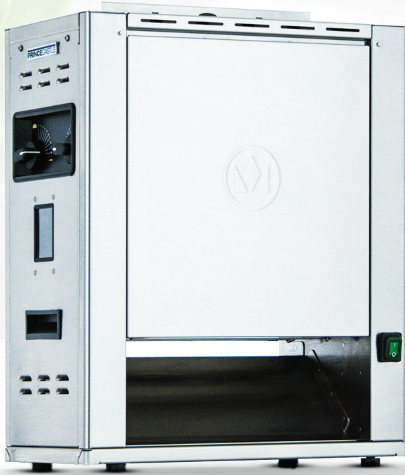
CTDE Two Lane - Dual Contact Toaster