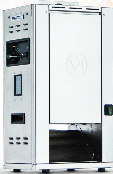
CTD Single Lane - Dual Contact Toaster