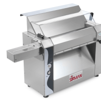
Sansone 42 with optional pasta cutter