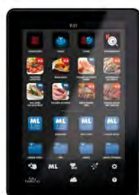
LCD 10" Touch Screen

AUTOMATIC INTERACTIVE COOKING TOUCH SCREEN CONTROLS EQUIPPED WITH N. 1 TROLLEY KKS202