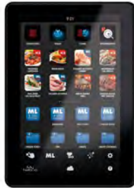
LCD 10" Touch Screen

AUTOMATIC INTERACTIVE COOKING TOUCH SCREEN CONTROLS