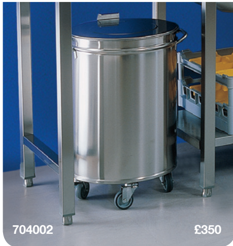
Stainless steel scrap bin c/w castors and lid