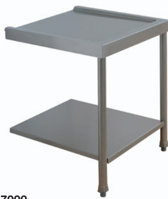
Closed end table c/w undershelf. 700mm long, 615mm deep