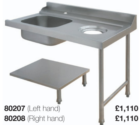
Closed end table c/w splashback, short undershelf, sink and scrap hole. 1200mm long supplied with rubber scrap hole protection ring. (Right hand as illustrated)