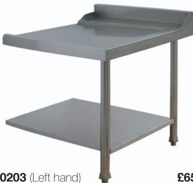
Closed end table c/w splashback and undershelf. 1200mm long. (Right hand as illustrated)