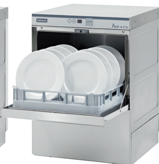
51 XL & 55 XL WSD