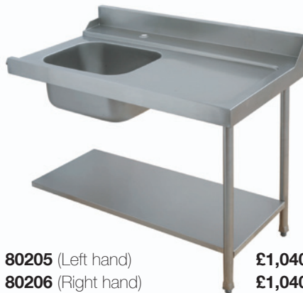
Closed end table c/w splashback, undershelf and sink. 1200mm long. (Right hand as illustrated)