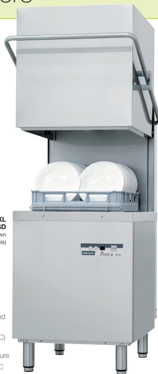
80 XL, 91 XL & 95 XL WSD (91 XL model shown with soft touch controls)