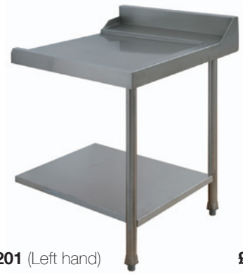
Closed end table c/w splashback and undershelf. 700mm long. (Right hand as illustrated)