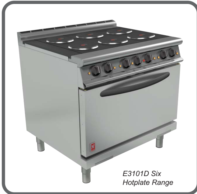
E3101D Six Hotplate Range