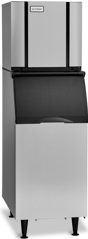
CIMO520 ON B42