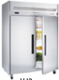
HJ2 Double door refrigerator

45 cu/ft capacity +1°C/ +4°C temperature 6 adjustable 2/1GN shelves Net weight: 164kg 1400mm W x 815mm D x 1965mm H