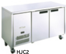
HJC2 Two door refrigerated counter

Also available in -2°C/ +2°C meat storage and -18°C/-22°C freezer models