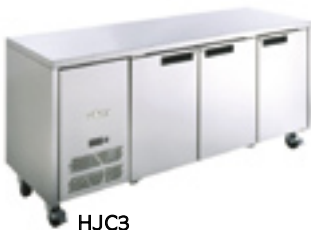
HJC3 Three door refrigerated counter

Also available in -2°C/ +2°C meat storage and -18°C/-22°C freezer models