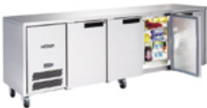
HJC4 Four door refrigerated counter

Also available in -2°C/ +2°C meat storage and -18°C/-22°C freezer models