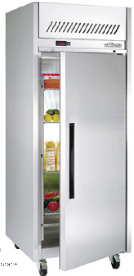
HJ1 Single door refrigerator

24 cu/ft capacity +1°C/ +4°C temperature 8 adjustable 1/1GN shelves Net weight: 150kg 2350mm W x 659mm D x 865mm H